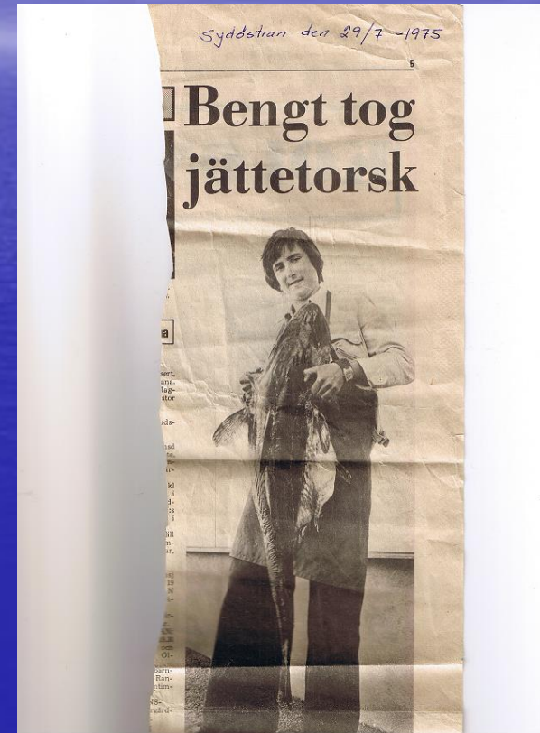
In the 70s, 80s and 90s,