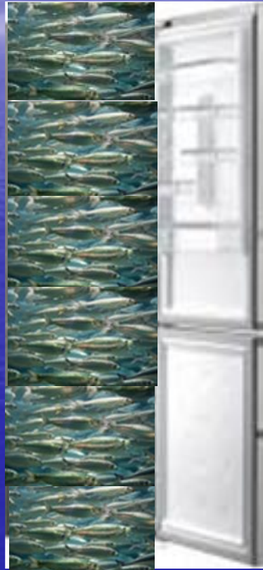
Sprat and herring