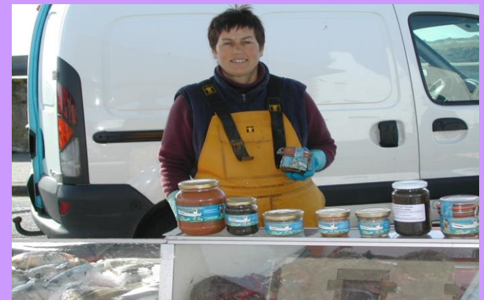
MAKING NEW PRODUCTS