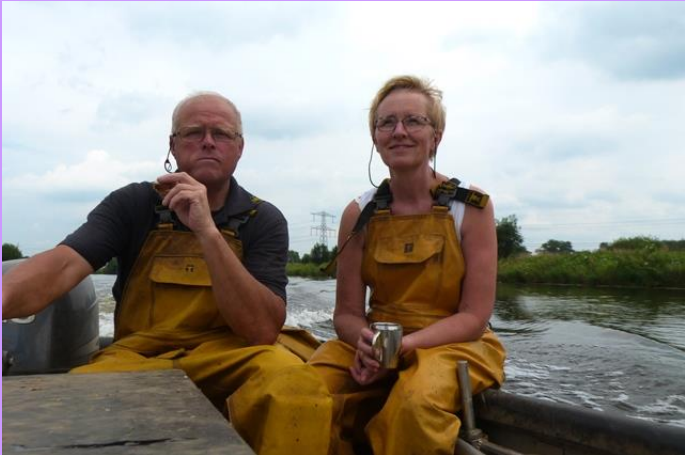
AKTEA women in fisheries

In 2016 AKTEA became partner of LIFE (Low impact fishers of Europe)