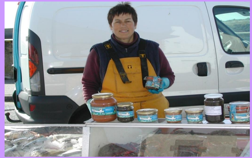
MAKING NEW PRODUCTS