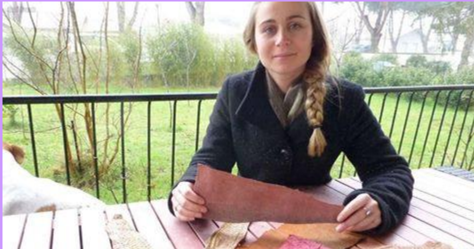
MAKING FISH LEATHER