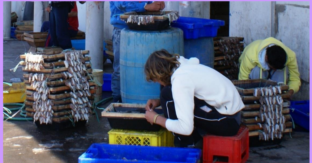
BAITING LONG LINES